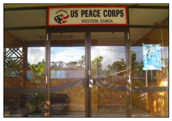
Entrance to the Peace Corps/Samoa office