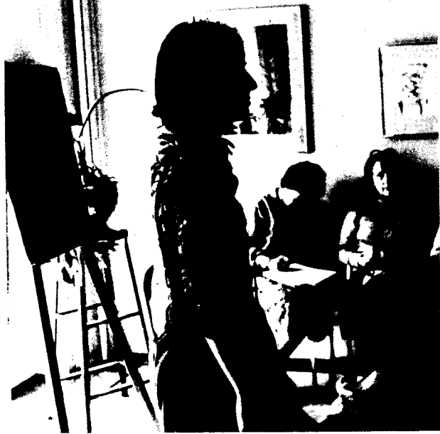
Displaced Homemakers Conference delegates tour the Center for Displaced Homemakers in Baltimore, Md., and (inset) attend a briefing on services provided by new Women's Resource and Advocacy Center.